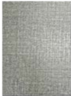
13_NS_WO NICKEL SILVER WOVEN