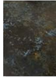
04_BR_NB * BRASS NEBULA