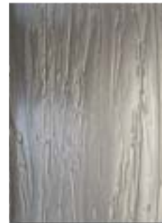
16_GB_LN GUNMETAL BRONZE LINEAR