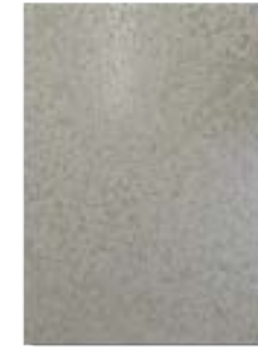
12_NS_RW NICKEL SILVER RAW