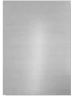
02_AL_BR ALUMINIUM BRUSHED