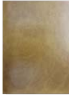
03_BR_WN BRASS WINDSOR