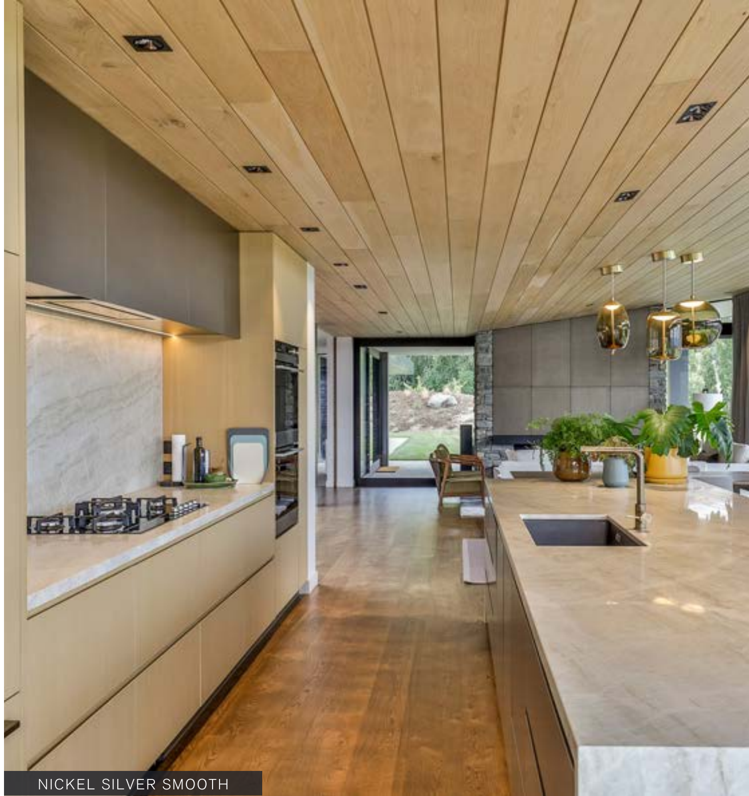
NICKEL SILVER SMOOTH

We will discuss the costs for training and the initial purchase of materials to create samples and practice your application.