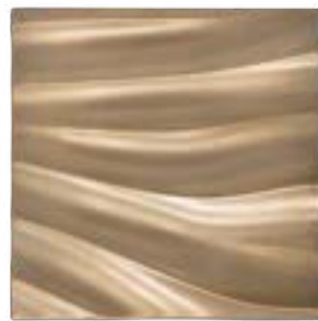
CLASSIC GOLD ★