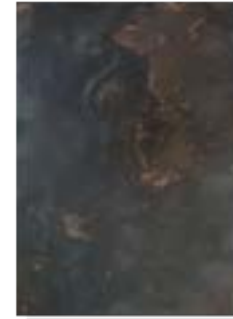
05_BZ_DM BRONZE DARK MOODY