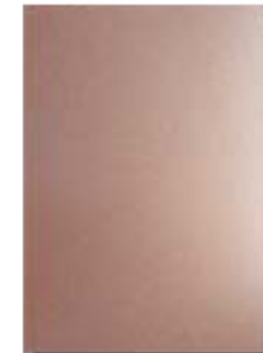
18_RG_SM ROSE GOLD SMOOTH

* These finishes are only available in the metal shown.