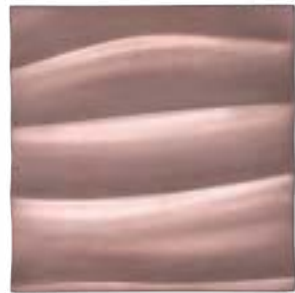
ROSE GOLD ★