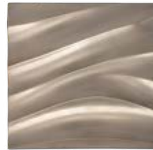
CHAMPAGNE GOLD ★