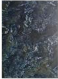
01_AL_BO * ALUMINIUM BLUE OILED