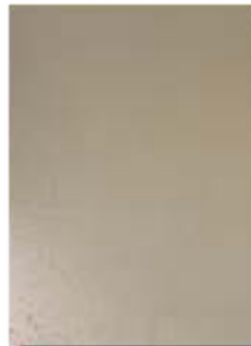
15_CM_RW CHAMPAGNE GOLD RAW