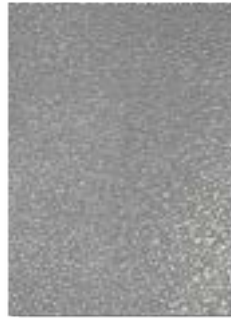
09_GM_LT GUNMETAL LIGHT TEXTURE