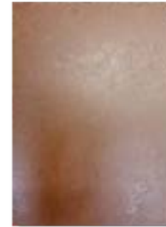
11_IR_RT * IRON RUST