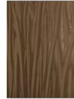
06_BZ_LN BRONZE LINEAR