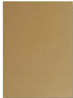
14_CG_SM CLASSIC GOLD SMOOTH