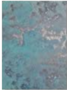
07_CO_VD COPPER VERDIGRIS