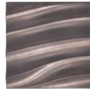
GUNMETAL BRONZE ★