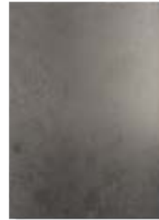
10_IR_LA IRON LIGHT AGED